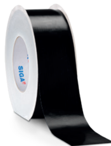
Wigluv ® black