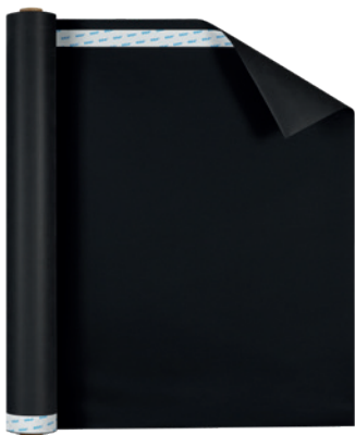
Majvest ® 700 SOB