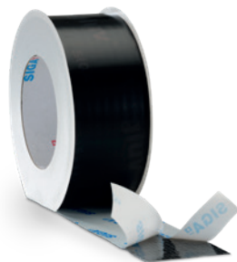
Wigluv ® black 20/40