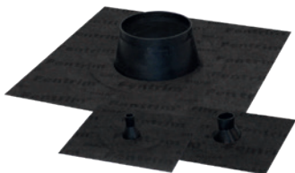
Fentrim ® grommet black